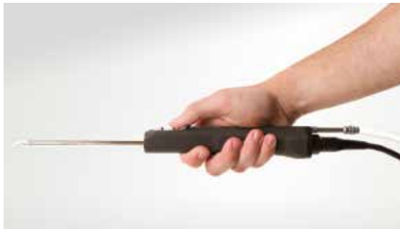
Integration in medical devices