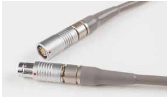
High heat applications