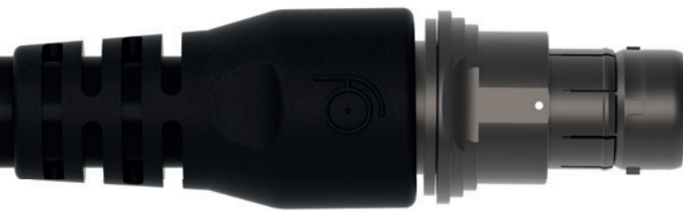
18 (42 contacts)