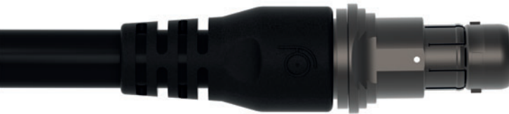
13 (2+3/3+3/27 contacts)