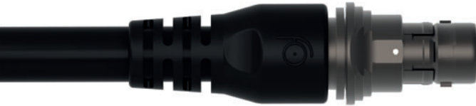
11 (8/12/16 & 19 contacts)