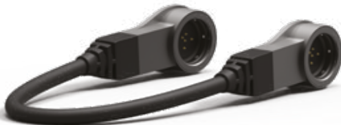
Fischer Freedom™ Series double end with thermoplastic overmolds