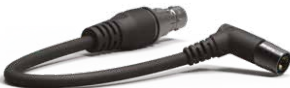
Straight and 60° thermoplastic overmolds for Fischer UltiMate™ Series and Fischer MiniMax™ Series