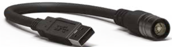
USB 3.0 using Fischer MiniMax™ Series