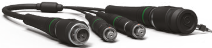
Fischer FiberOptic Series with multiple terminations

Fischer Connectors has helped hundreds of customers find the right assembled solution that fulfills their unique technical, quality and cost requirements. We support your project from design to manufacturing, making your life easy.