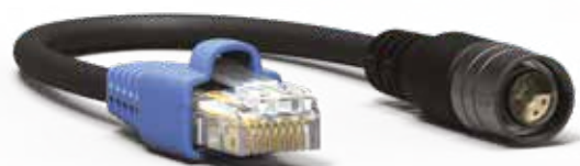
Ethernet using Fischer MiniMax™ Series