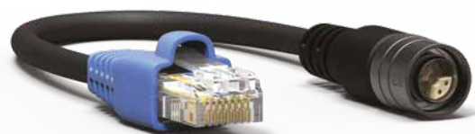
Ethernet using Fischer MiniMax™ Series