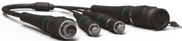
Fischer FiberOptic Series with multiple terminations

Fischer Connectors has helped hundreds of customers find the right cable assembly solution that fulfills their unique technical, quality and cost requirements. We support your project from design to manufacturing, making your life easy.