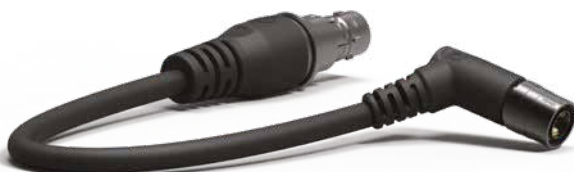
Straight and 60° thermoplastic overmolds for Fischer UltiMate™ Series and Fischer MiniMax™ Series