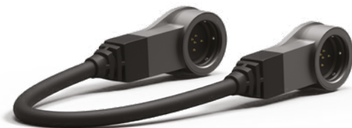
Fischer Freedom™ Series double end with thermoplastic overmolds