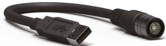
USB 3.0 using Fischer MiniMax™ Series