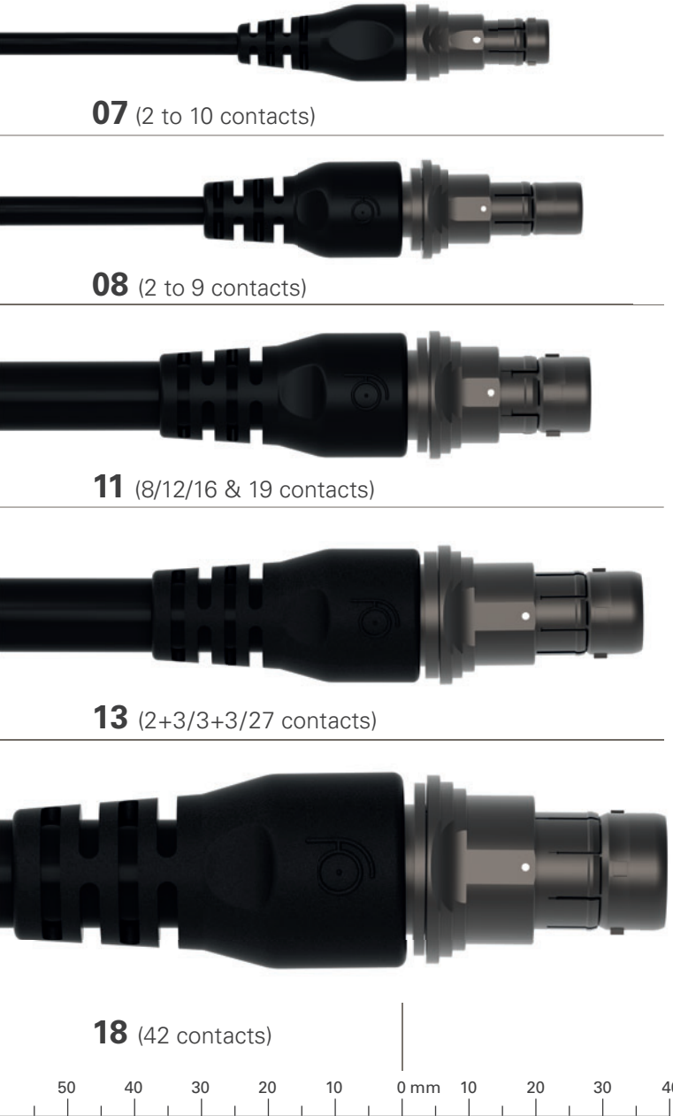
07 (2 to 10 contacts)