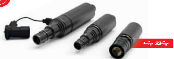
Available with UltiMate and MiniMax interfaces.