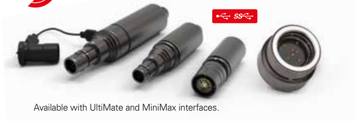
Available with UltiMate and MiniMax interfaces.